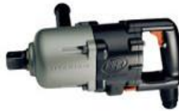
1" -1-1/2" IMPACT WENCHES AVAILABLE 10CFM- 2500 FT LBS MAX TORQUE