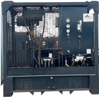
60 GPM HYDRAULIC POWER PACK AIR START & VALVE THROTTLE ADJUST 25 GALLON DIESEL TANK EMERGENCY STOP