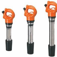
8 STROKE & 11 STROKE 37CFM, 720 BLOWS / MIN