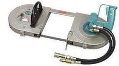
CUTS UP TO 9" O.D. 1.6 HP, 2000PSI, 4GPM