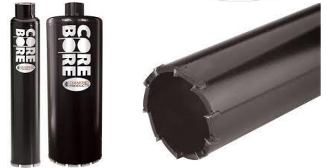
CARBIDE CORE BITS 2"-CUSTOM SIZES DIAMOND TIPPED CORE BITS CUSTOM TIPPED CORE BITS TO FIT NEED