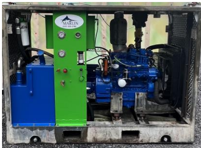
50 GPM HYDRAULIC POWER PACK AIR START & VALVE THROTTLE ADJUST 25 GALLON DIESEL TANK EMERGENCY STOP