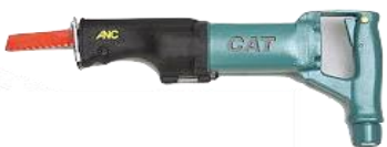
CUTS UP TO 6" DIAM STEEL 1.3HP, 46CFM, 90 PSI 0-1800 STROKES / MIN