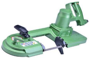
CUTS UP TO 4" O.D. .7HP, 90 PSI, 20CFM