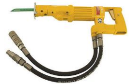
CUTS STEEL PIPE UP TO 6" 1700 STROKES/MIN 2HP 2000PSI 6GPM