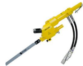
CUTS STEEL PIPE UP TO 30" O.D. 100-500 STROKES PER MIN 3.8HP, 2000PSI, 4GPM