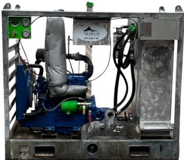
25 GPM HYDRAULIC POWER PACK AIR START & VALVE THROTTLE ADJUST 25 GALLON DIESEL TANK EMERGENCY STOP