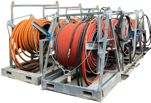
600' HYDRAULIC HOSE REELS HYDRAULIC MOTORIZED EMPTY REELS